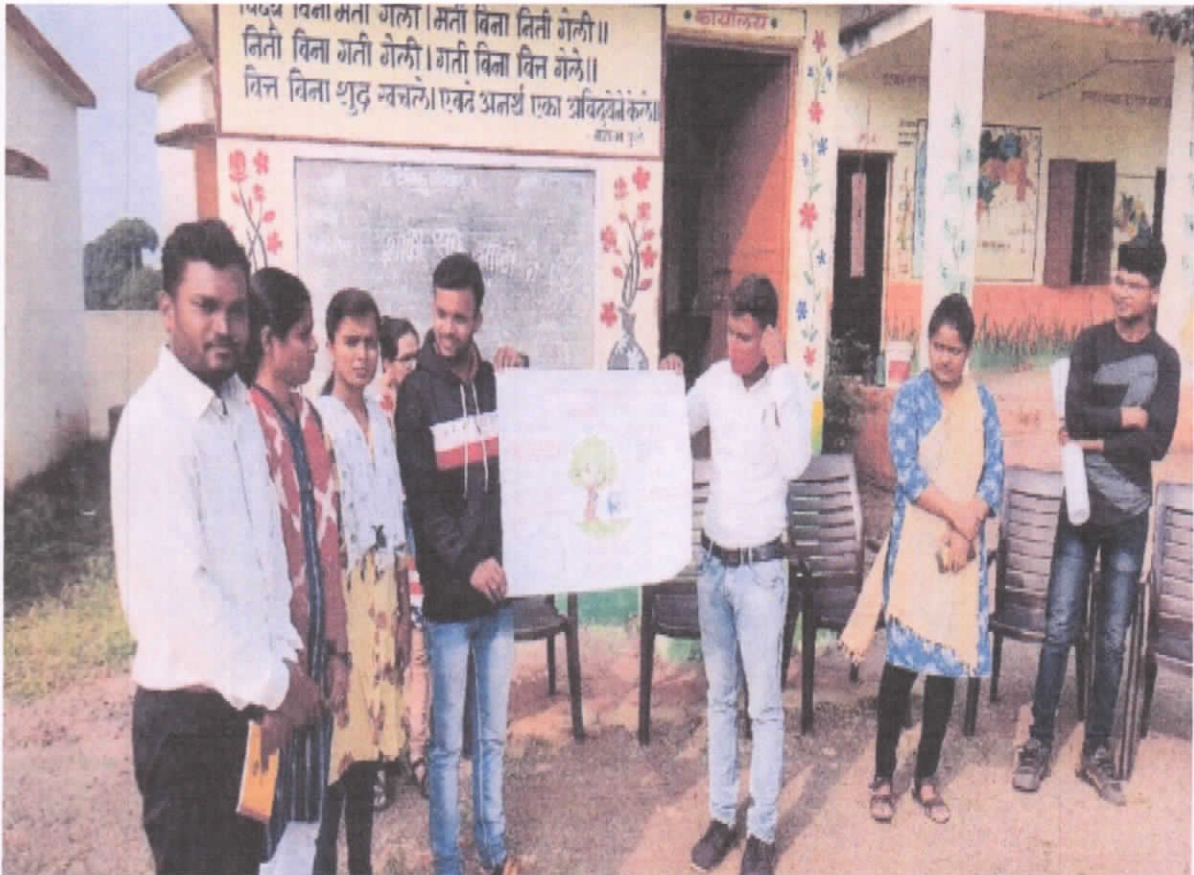
MSW Students showed in explained the ecological balancing and The importance of plantation.