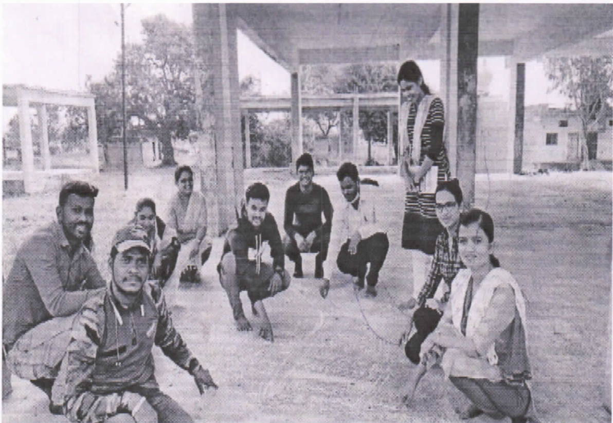
Students of MSW showed and explain the diagram of village Pokhari