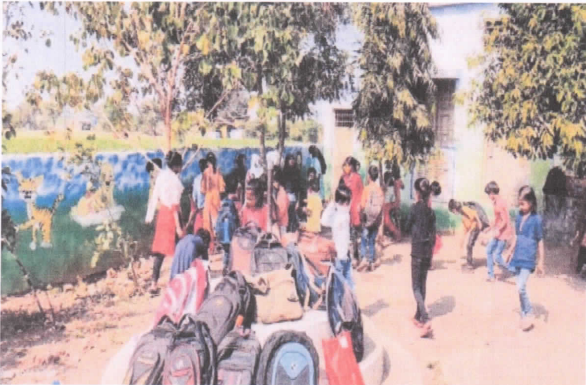
Students were showed to clean the school campus.