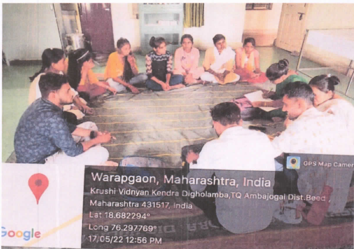
MSW students discussed the issues of tailoring course at Warapgaon.