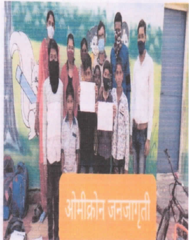
The beneficiaries were showed during the vaccination.