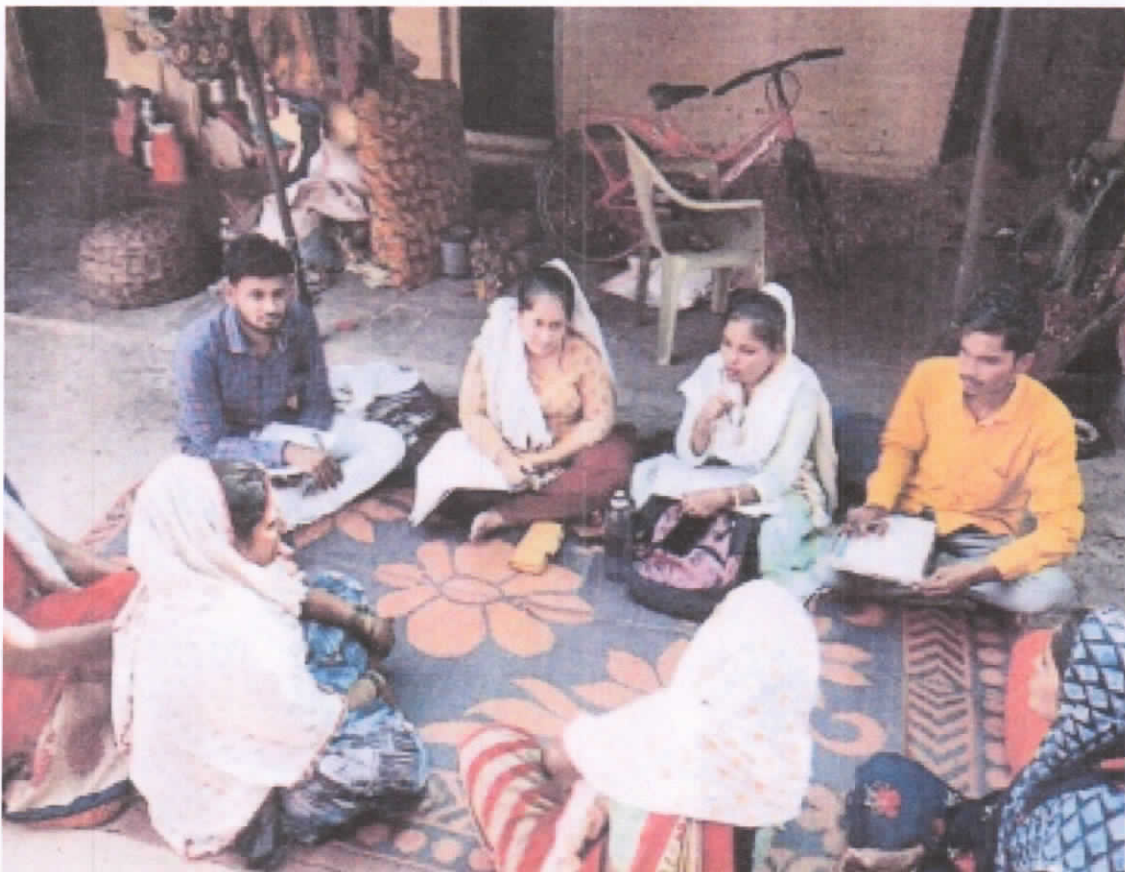
Students were discussed and collect information on their business done by Women